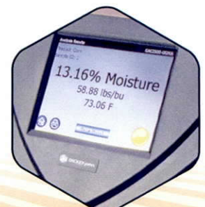
Easy-to-Read Results Screen