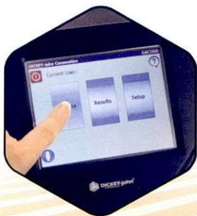
Intuitive Color Touchscreen