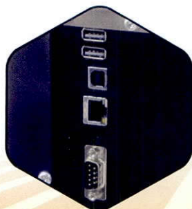
Multiple Back USB Ports